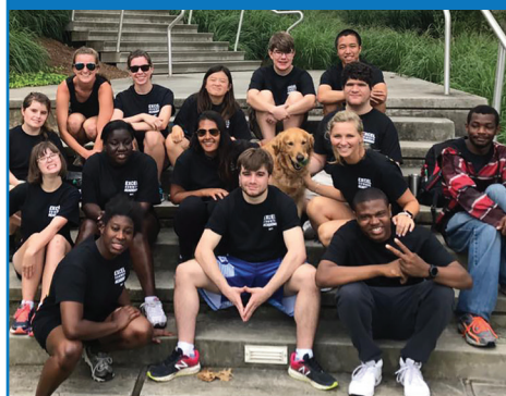
Excel Program at Georgia Tech

"[My son's] a different person than he was two-and-a-half years ago. He's surpassed every goal and he's happier than I've ever known him to be."