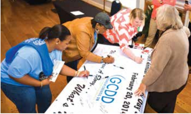
Attendees signed the petition at the 2014 Disability Day at the Capitol.