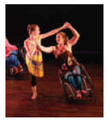
Professional dance troupe, Full Radius, employs dancers with and without disabilities.