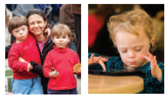
Including advocacy for children, GCDD joined the Children's Freedom Initiative coalition to allow children to live in loving homes in integrated communities.