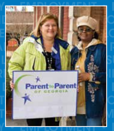
Advocates from partner organizations rallied for more services and supports.