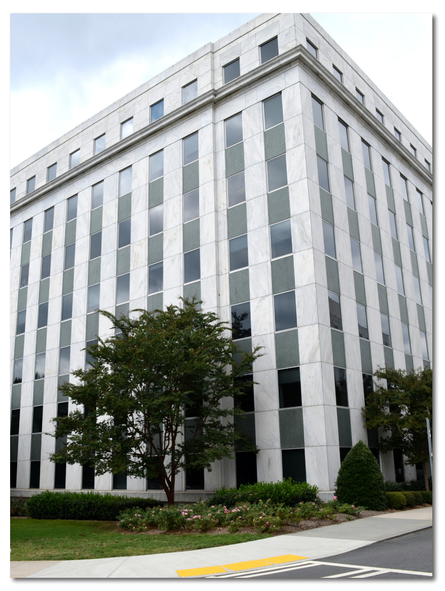
Contact the State ADA Coordinator's Office for more detailed information about wayfinding and access for Capitol Hill, or to request alternate document formats.