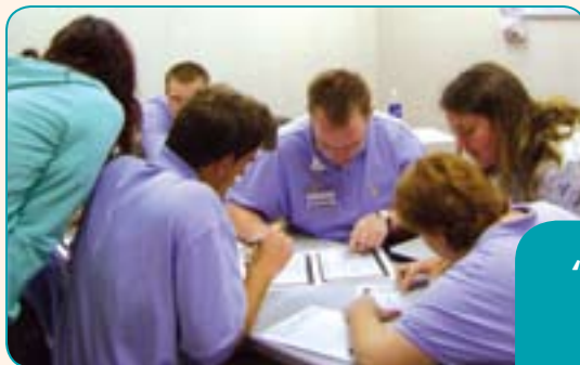
Walton interns combine classroom and hands-on work to improve job skills.

“The staff is treating the interns like regular employees.”