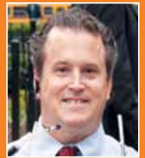
JOSEPH D. FRAZIER